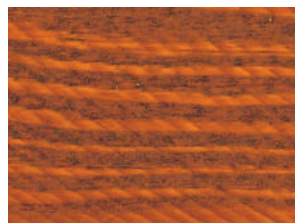
668 Red Mahogany