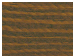
731 Nut Brown